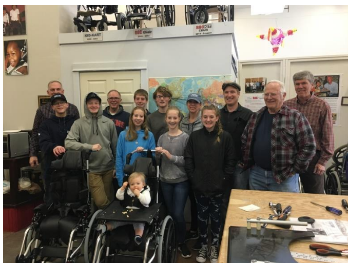
The Whole Gang