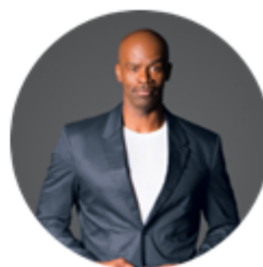
Michael Jr. Comedian

JOIN THOUSANDS OF CHRISTIAN COUPLES IN CHURCHES AROUND THE COUNTRY FOR A ONE-NIGHT LIVESTREAM EXPERIENCE