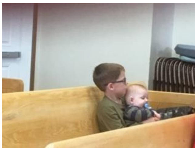
Big Brother Ryder taking care of Ridge