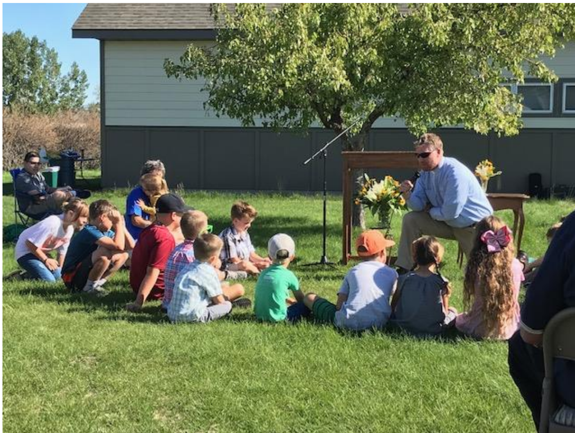
Children's Message at the Congregational Picnic