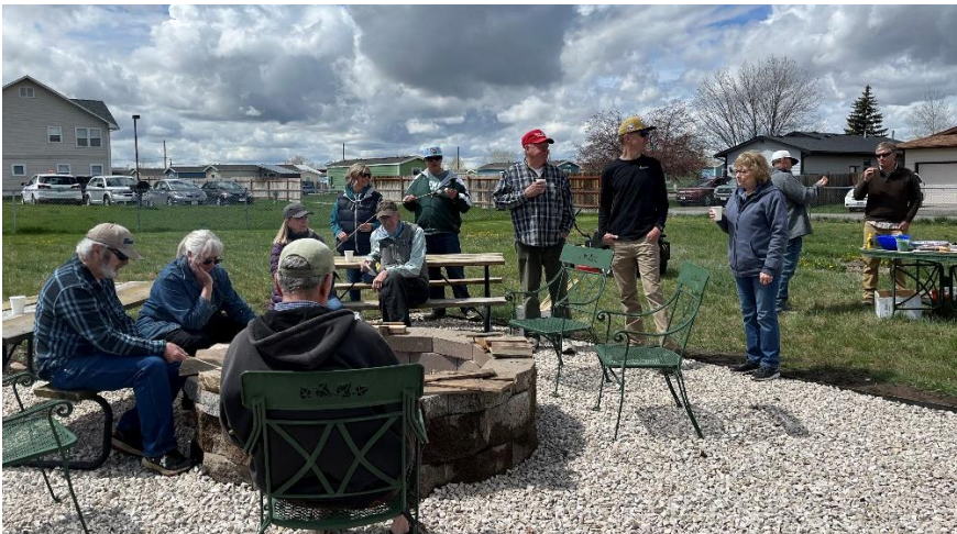
Snack time after an awesome clean-up day!